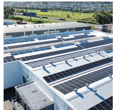
Step 3: Apply One Coat Alumanation 301