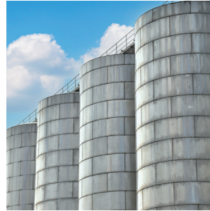
Steel Storage Tanks