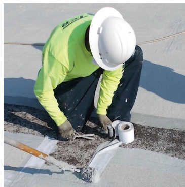
Step 2: Detail with Geogard Seam Sealer