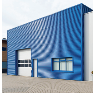
Metal Side Walls