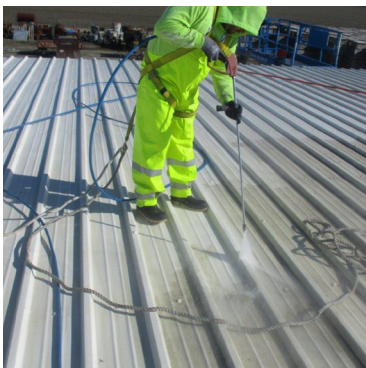
Step 1: Clean with Roof